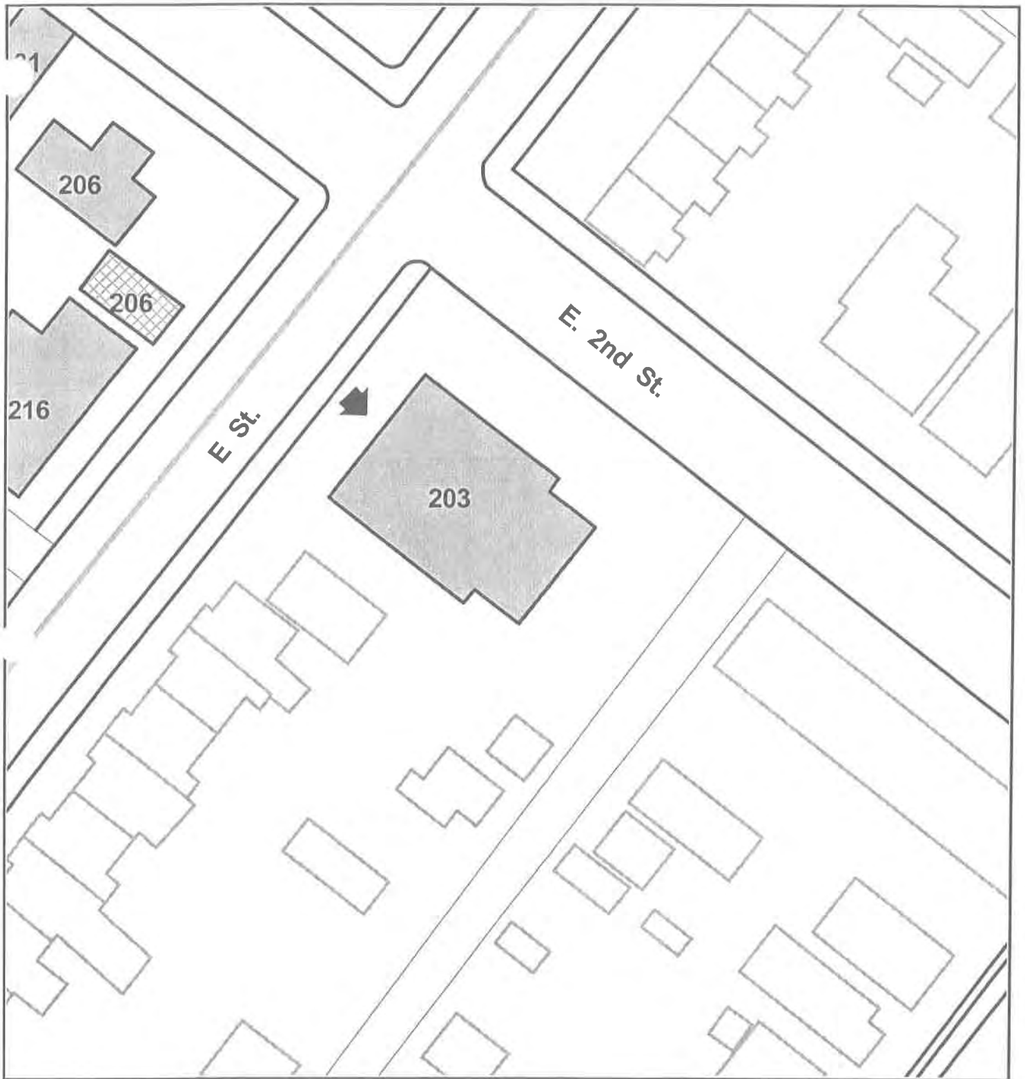
203 E Street, 5CF1579