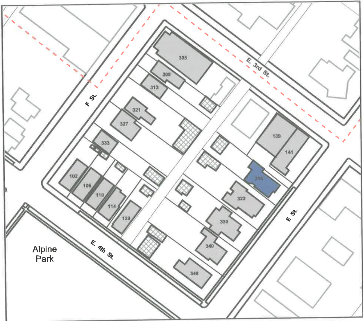
316 E Street