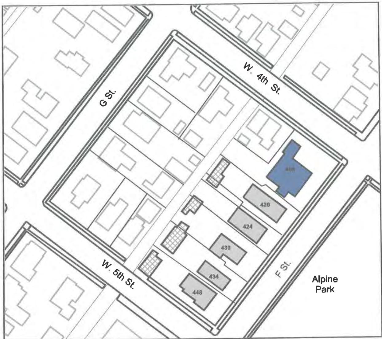
408 F Street