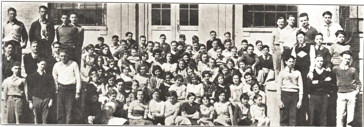
CLASS OF 1936