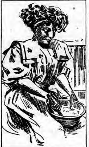
"In the Kitchen With an Apron On, Helping Her Mother Put Up Jellies and Preserves and Things."

Prudence almost capsize the boat from sheer vexation then. When a woman becomes vexed with a man because he does not realize that he loves