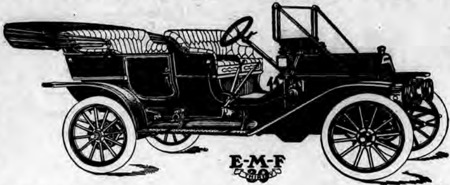
1911 Model E-M-F "30" Standard Five-Passenger Touring Car, $1,000