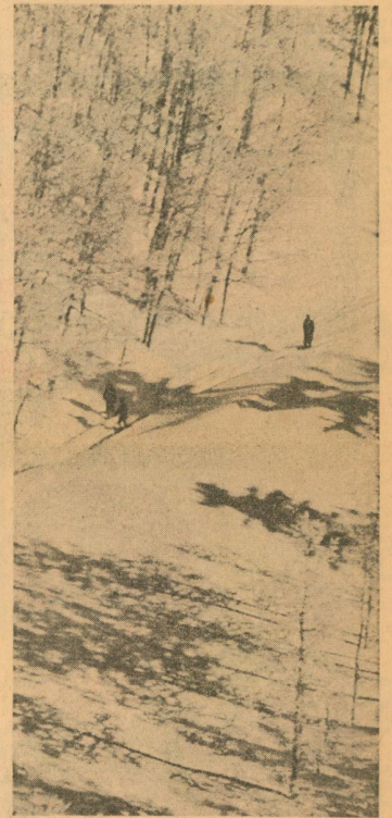
Three of the first men rescued from Coxo siding walk along trail broken by two army weasels on way to Chama, N. M., just across the Colorado line.

Shown here are a series of aerial pictures taken Thursday by Albert Moldvay, Denver Post staff photographer, in the Cumbres Pass region of extreme southern Colorado. Pictures cover the rescue of 40 Rio Grande railroad crewmen at Coxo siding a mile from the pass summit, and tell the status of 20 other crewmen still marooned on the summit itself. Army weasels went to Coxo Wednesday night, and began evacuating the men Thursday morning. Plans possibly involving a helicopter are now being formed to rescue 20 railroaders atop pass. Plane carrying Moldvay was a Cessna 170 from Denver Air Taxi service, piloted by R. G. "Dick" Koplitz.