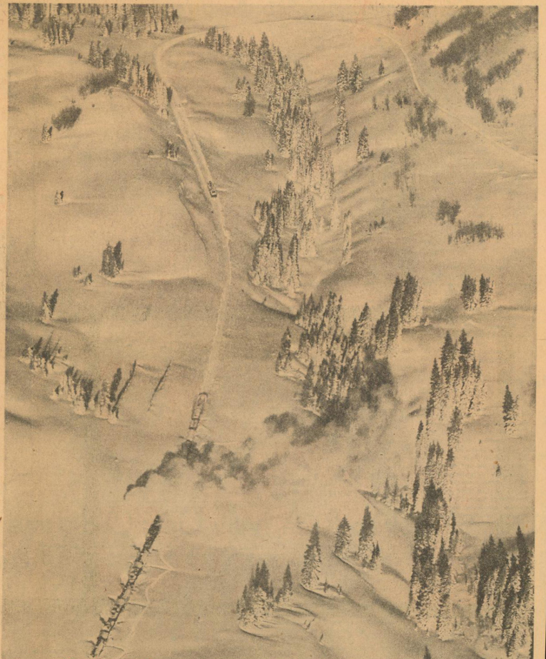
Jim Pease - Durango crew - was on train in this photo FOUR STEAM LOCOMOTIVES ARE STALLED ON A HORSESHOE TURN BELOW WINDY POINT ON CHAMA SIDE OF PASS