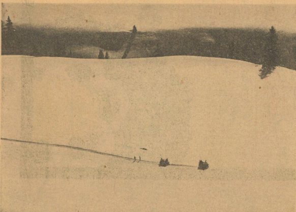
TWO ARMY WEASELS CHURN ACROSS AN OPEN FIELD, ONE TOWING TWO SKIERS