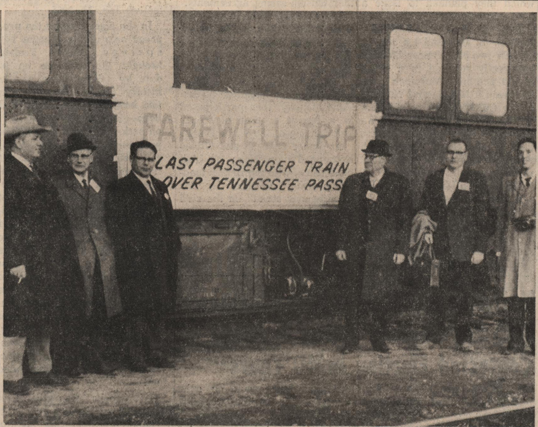
SPECIAL CAR — Shown beside the special, private care attached to the regular D & RG train going West Saturday are several Salidans who made the special trip as far as Buena Vista to mark the last trip West of Salida by the D & RG passenger trains and two members of the Railway Historical Society. This special car, owned by the Intermountain Chapter of the National Railway Historical Society is rather special. It was built in 1887, redone in 1916 and weighs 89 tons. It was bought from the Burlington railroad, who had built it originally for their staff. The area chapter of the Society commemorated the final trip West of Salida and through the Tennessee Pass by making the trip in this car.