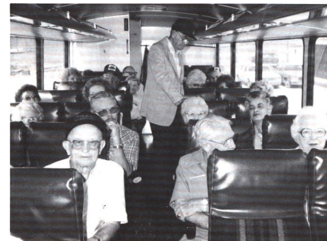
Convention bus trip to Wendover