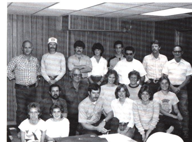
GRAND JUNCTION CPR CLASS